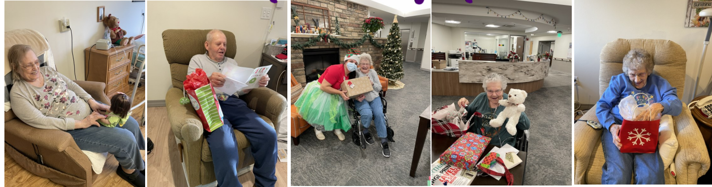
Our residents enjoyed a very Merry Christmas! Thank you to everyone who donated to our giving tree or funds for the Christmas party. Many smiles on Christmas Day!