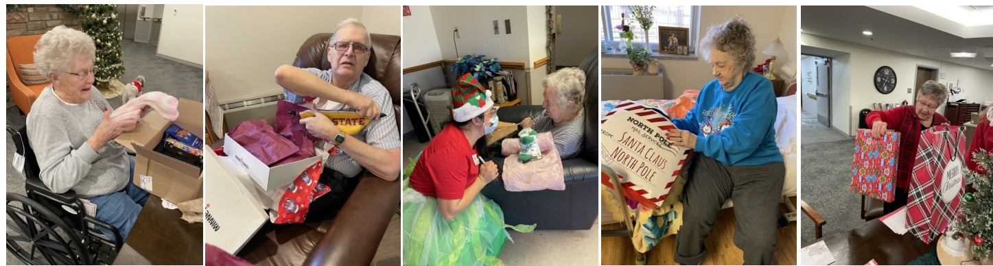
This year the resident council was able to adopt a family for Christmas! Thanks to everyone who has supported the resident council fundraisers!