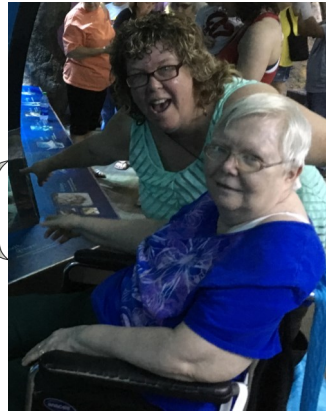
Fun at the zoo!