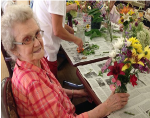
Making floral arrangements

Medicaid MCO Plans No earlier than 12 months after your original enrollment date