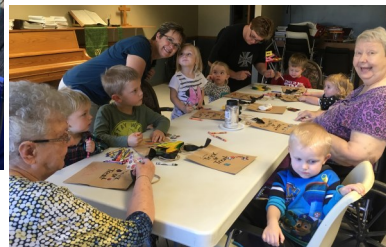
Decorating Treat Bags with the Children