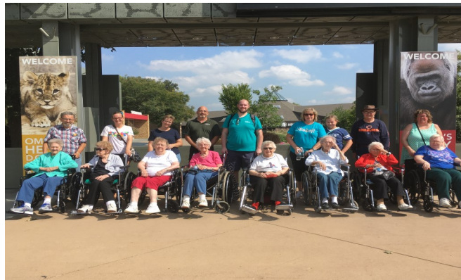
Annual Omaha's Henry Doorly Zoo Trip