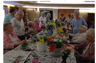
The Garden Club