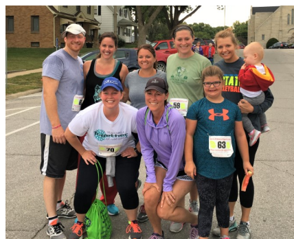
Above: Runners pose at the finish line.