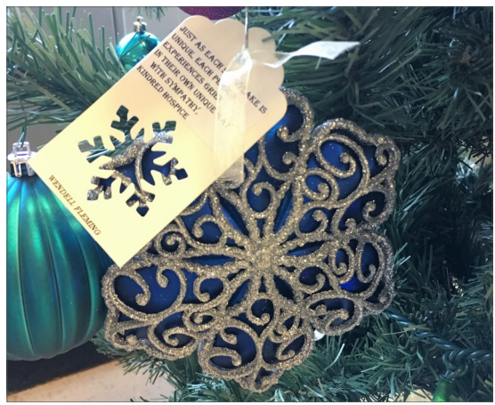
Celebrations and Remembrance Top Left: Santa visits the memory unit. Above: Members of the community enjoy the Friendship Home Chamber Brunch. Left: Kindred Hospice hosted a remembrance service to honor all the friends we have lost throughout the year. They helped decorate our tree with a special snowflake ornament for each loved one gone.